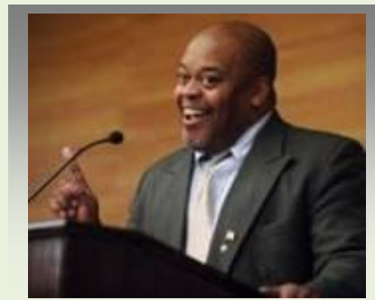
Niger Innis Congress of Racial Equality